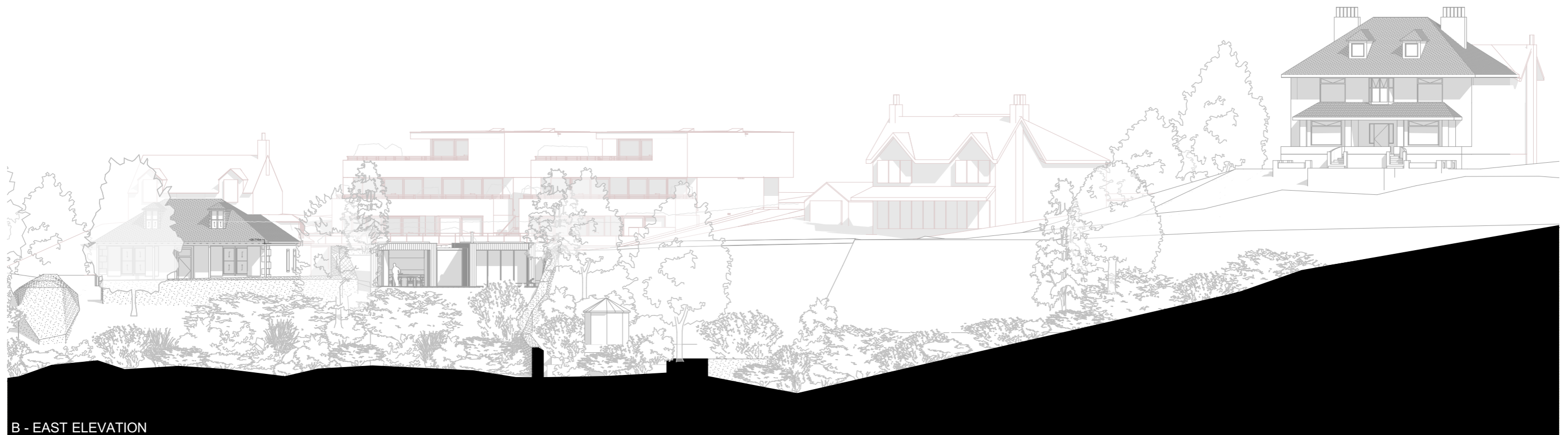
B - EAST ELEVATION